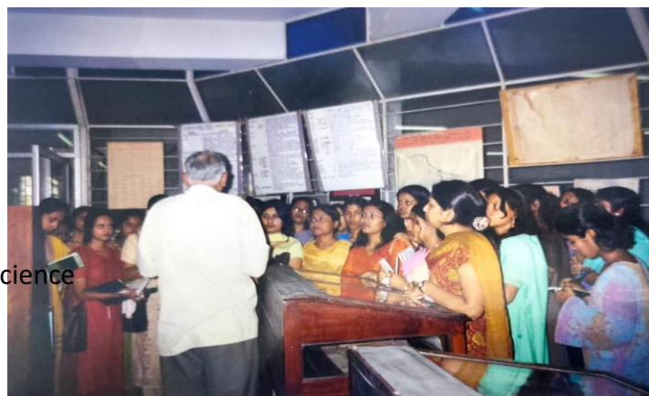
Students in front of Carey Museum