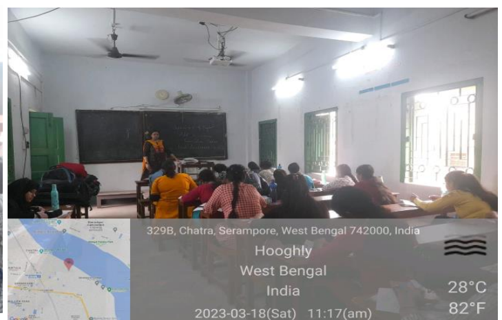
Classroom of Translation studies image on 18/03/2023

Soma Roy, Principal Serampore Girls' College Serampore, Hooghly Signature of Principal