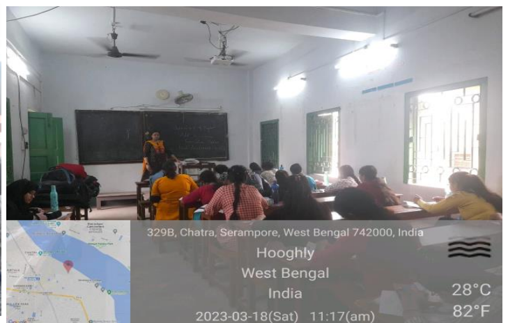
Classroom of Translation studies image on 18/03/2023

Soma Roy, Principal Serampore Girls' College Serampore, Hooghly Signature of Principal