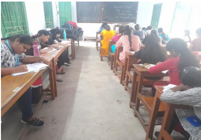
Students attending the class of translation studies