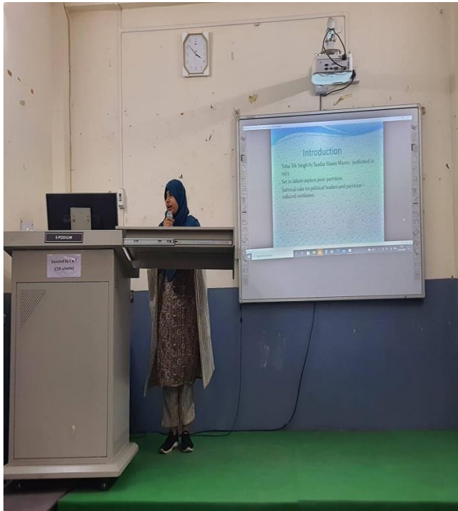
Advanced Learner presenting her paper