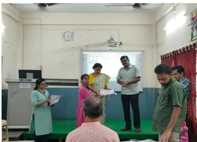
Certificates awarded to the Presenters